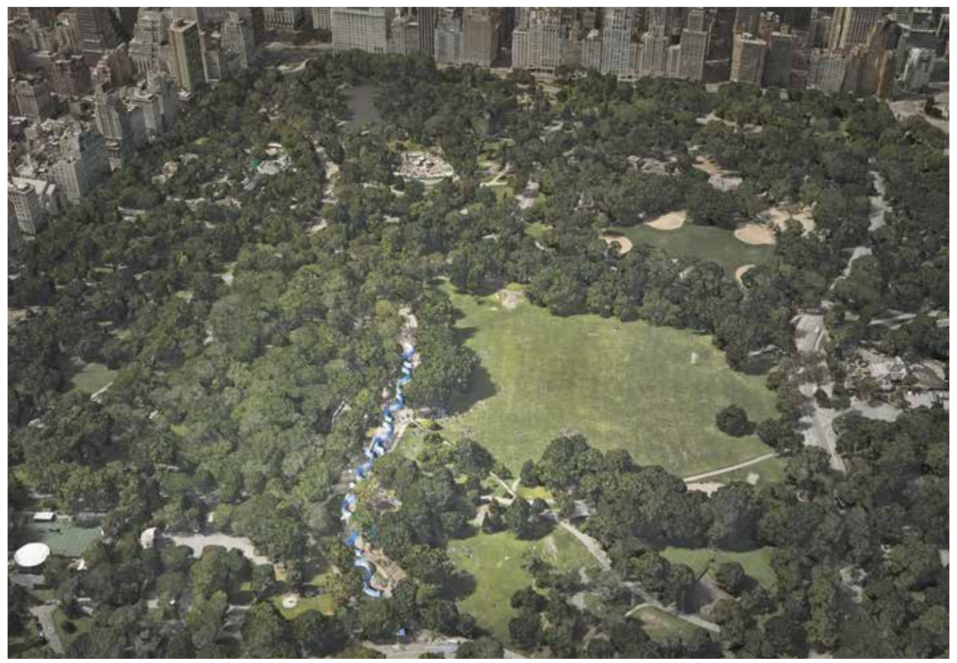
Breathe With Me in Central Park, New York City, September 2019